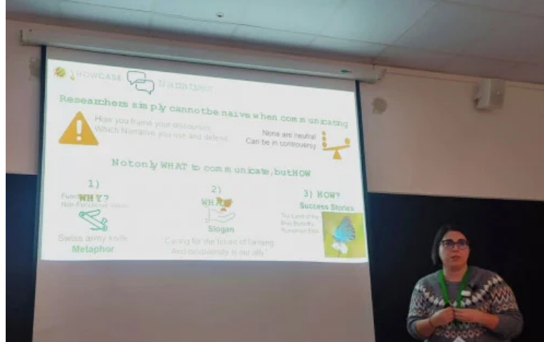
9th International Congress of Agroecology