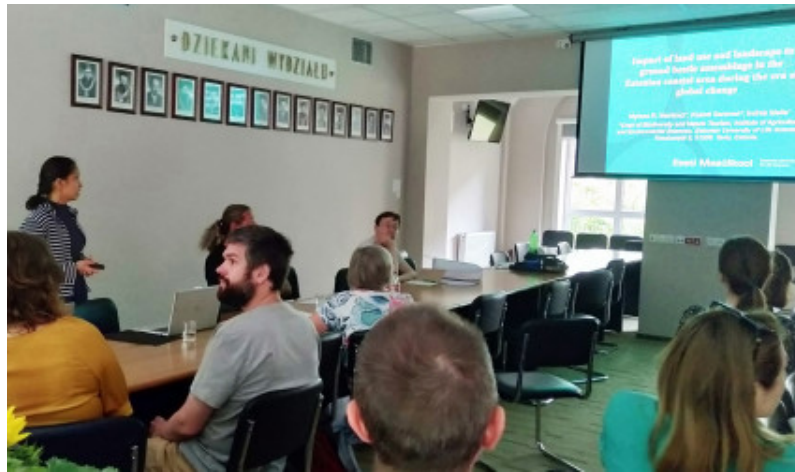
International symposium in Poland