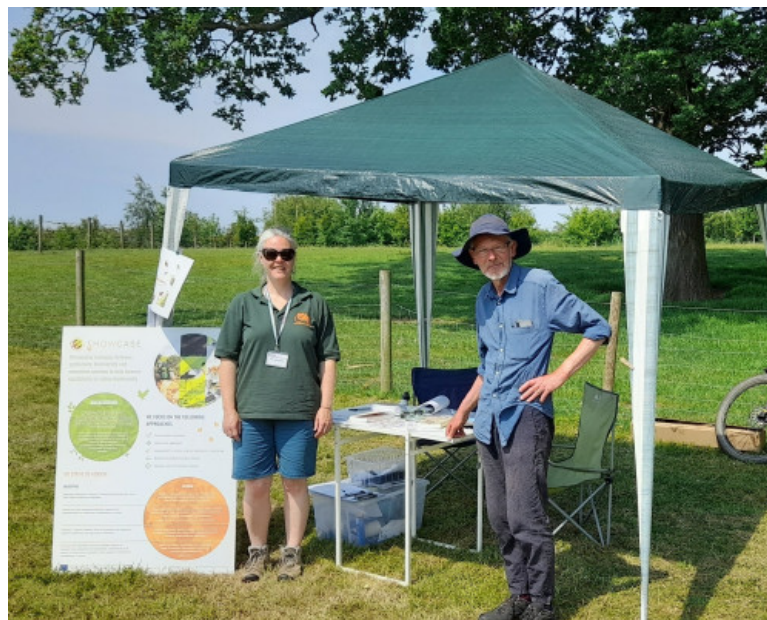
LEAF's Open Farm Sunday